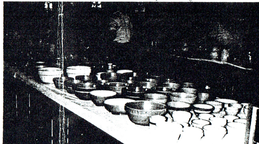
*These photos are available from Henagers 3/$1.00